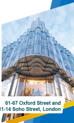
61-67 Oxford Street and 11-14 Soho Street, London