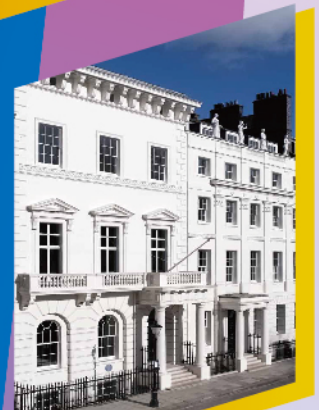
11 and 12 St James's Square and 14 to 17 Ormond Yard, London