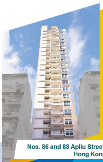
Nos. 86 and 88 Apliu Street, Hong Kong