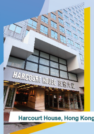
Harcourt House, Hong Kong