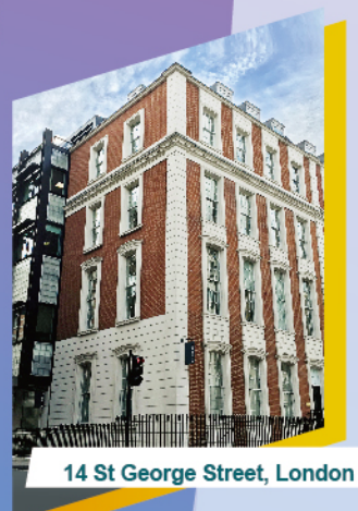
14 St George Street, London