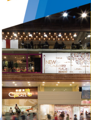
Causeway Place, Hong Kong