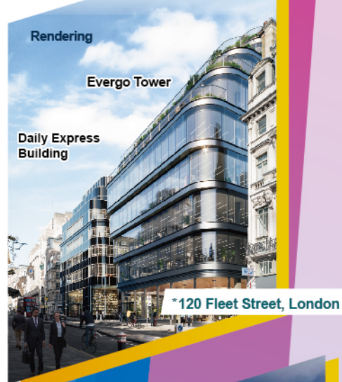
*120 Fleet Street, London