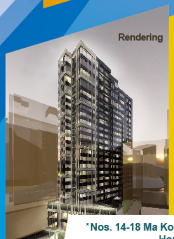
*Nos. 14-18 Ma Kok Street, Hong Kong